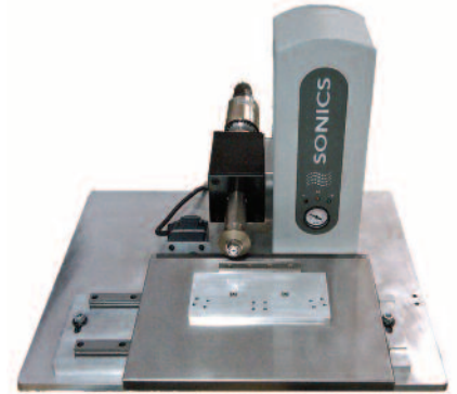
MSWA20ST12 Vertical Actuator with Motorized Slide Table and Plate

Sonics' 20 kHz ultrasonic seam welding systems consist of a welder (available as a stand-alone unit or with an actuator, per the models shown above) and a power supply as shown below.