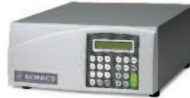
MXC Series Low Profile