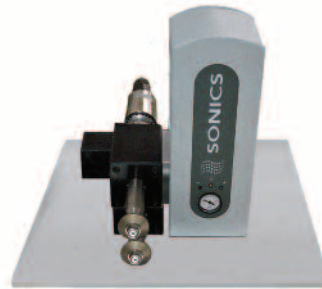
MSWA20RA Vertical Actuator with Rotary Anvil and Plate