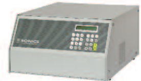
MXC Series High Profile

Sonics' MX Series power supplies are available in 2 versions: a low profile model for 1500 and 2500 watt units, and a high profile model for 4000 watt units. The features of the models are noted below.