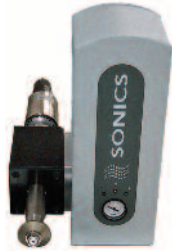
MSWA20 Vertical Actuator