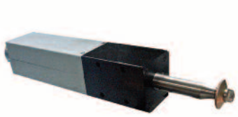
MSW20 Seam Welder