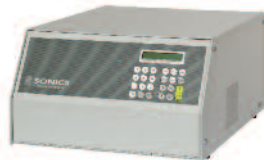
MX Series High Profile