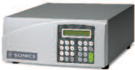
MX Series Low Profile