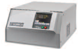
MSC High Profile