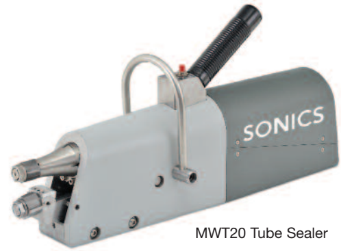
MWT20 Tube Sealer

Sonics' 20 kHz ultrasonic tube sealing systems consist of the actuator shown above and a power supply, the MX or MSC series, as shown below.